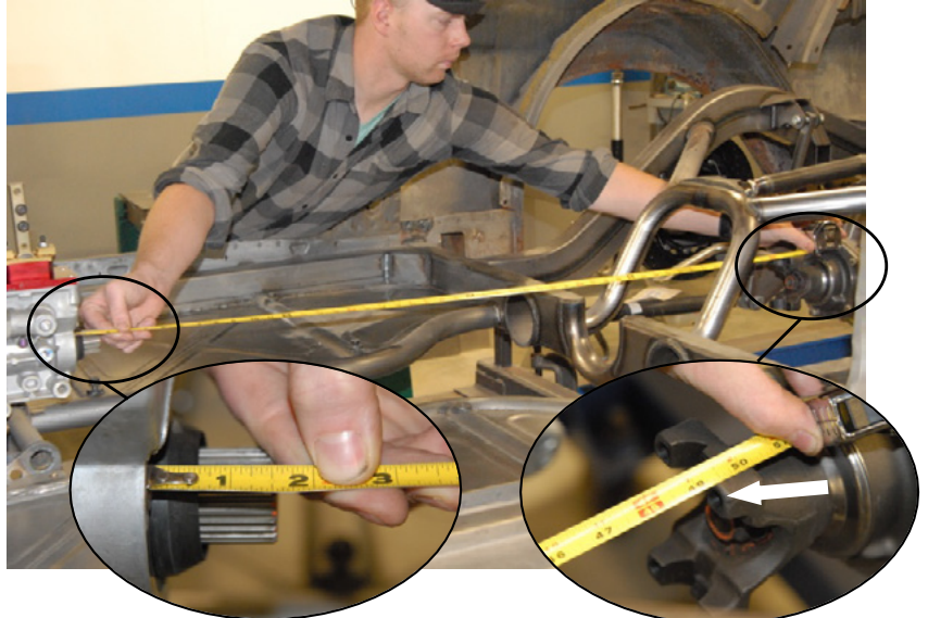
Question 1 - Transmission tail housing measurement point.

Question 1 - Measure the distance from the face of the transmission extension housing to the face of the pinion yoke. Note: Tape measure is on the housing not the seal or output shaft.